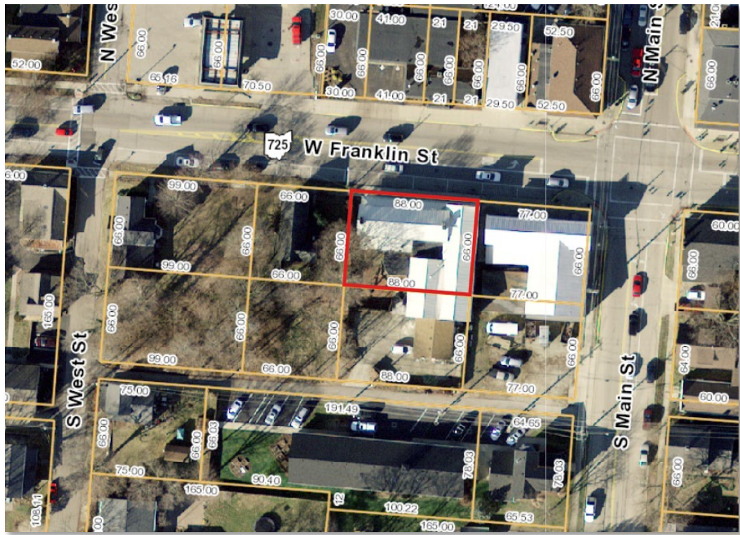
Figure 1 Location Map