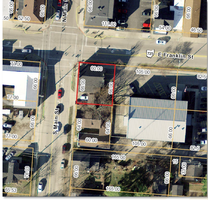
Figure 1 Location Map