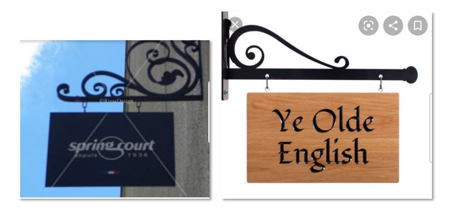
Figure 3 Applicant provided Examples