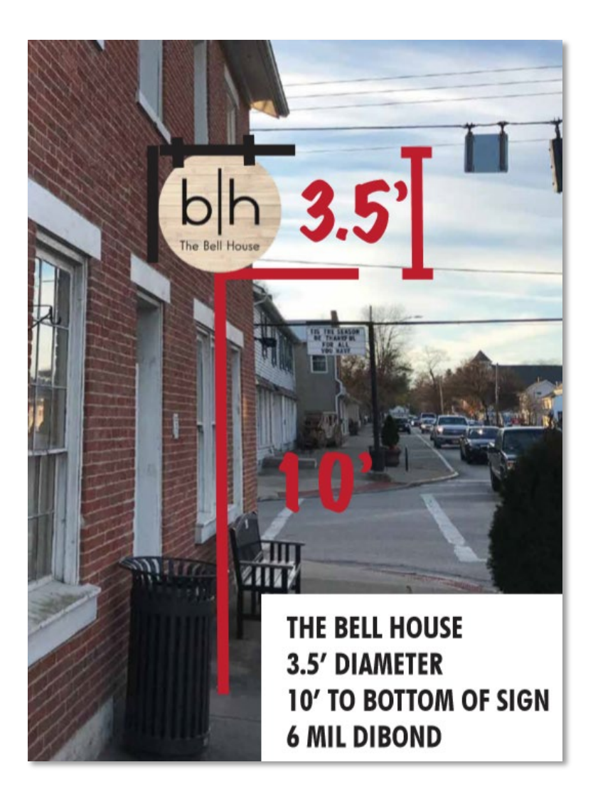
Figure 3 Height Example