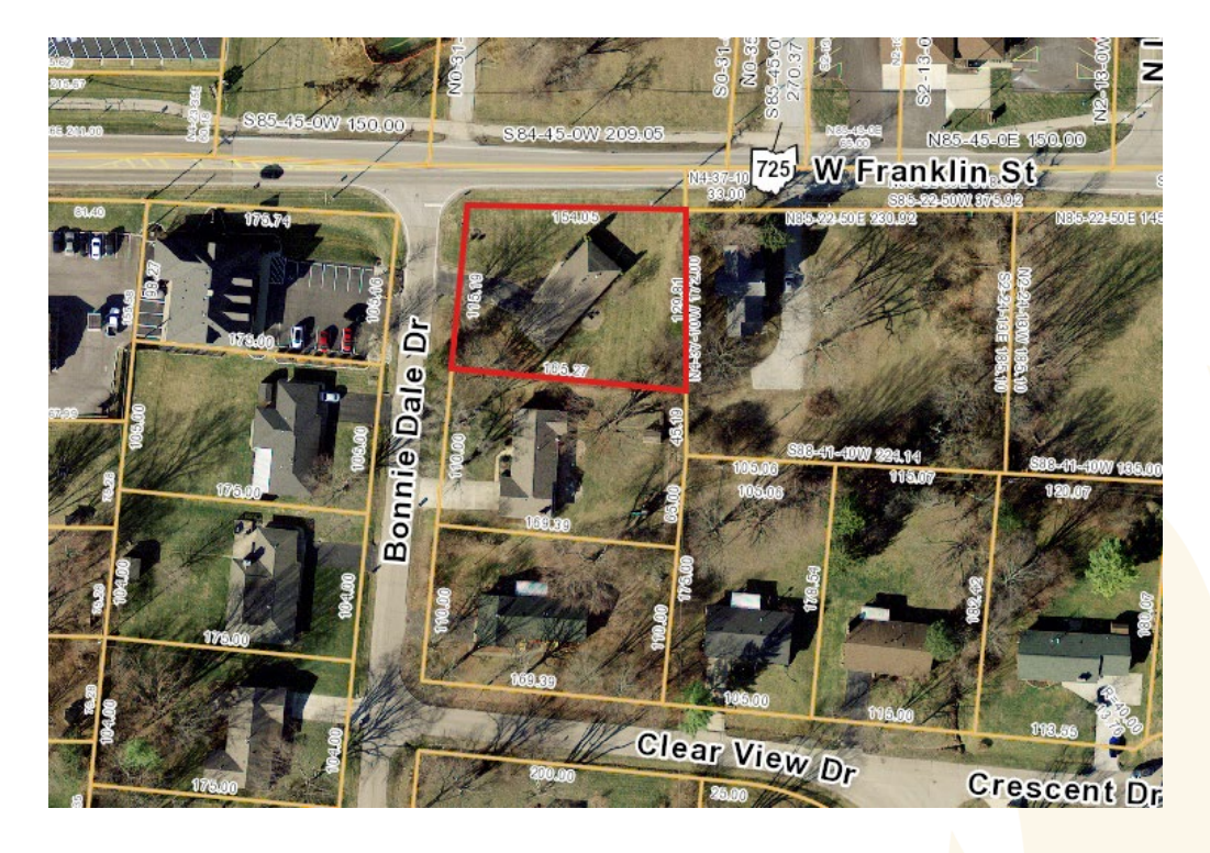
Figure 1 Location Map

Location: Located at the intersection of Bonniedale Dr and W Franklin St.