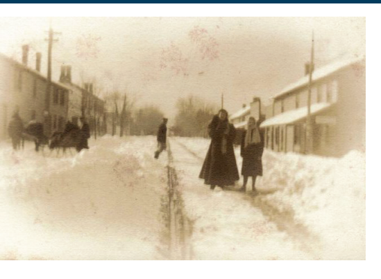
Pictured above: Snow in downtown Bellbrook - date unknown