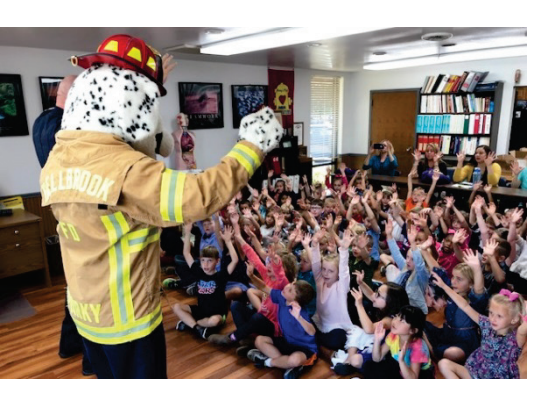
Pictured above: Students attending Fire Prevention Week

Open House On October 10, the Bellbrook Fire Department hosted its annual Open House. Each year, it is our privilege to open our doors to the public and allow them a closer look at the services we provide each and every day. We were pleased again with such a great turnout from the community with over 1,500 in attendance. With displays and demonstrations ranging from vehicle extrication to the LUCAS CPR machines, there is something for everyone to see. The Fire Prevention Week theme this year was, "Every Second Counts, Plan Two Ways Out!," in reference to planning emergency escape routes. If you have any questions regarding anything you saw during the Open House, please give us a call at (937) 848-3272 and we will be happy to help.