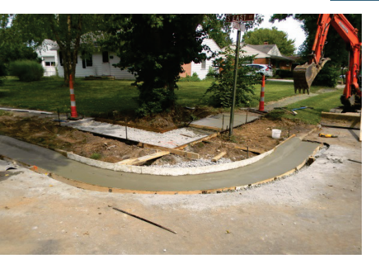
Pictured above: replacement of a ramp at South East Street and Brookwood Drive