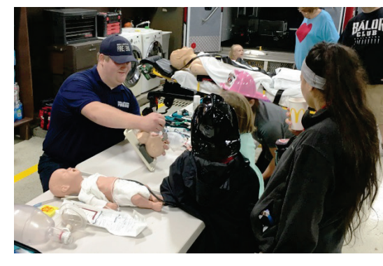
Pictured above: Fire Department Open House on October 10

Drive Thru Child Safety Seat Inspection The Bellbrook Fire Department hosted its 7<sup>th</sup> annual "Drive Thru Child Passenger Safety Seat Inspection" event on October 1. This event allows parents, grandparents, and caretakers to have their child's safety seat inspected and installed by a certified Passenger Safety Seat Technician. It is estimated that close to three out of four parents do not properly use child restraints. For this reason, the event stresses the importance of having a child safety seat installed properly. If you were unable to attend this event and would still like assistance installing your child's safety seat, you may contact the Fire Department at (937) 848-3272 to schedule an appointment.