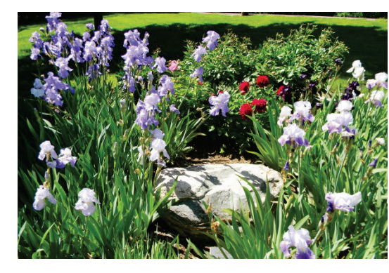
Pictured above: Irises at the Museum

Service Projects Winners of the Earth Day Poster Contest for 6<sup>th</sup> and 7<sup>th</sup> grade students will be displayed in Bellbrock Park during the Sugar Maple Festival. Winners are also recognized at a City Council Meeting. Currently, the Stephen Bell Elementary School courtyard is being renovated by members. On April 27 and 28, Club members will lead Stephen Bell second graders in making worm bins and learning about soil and composting