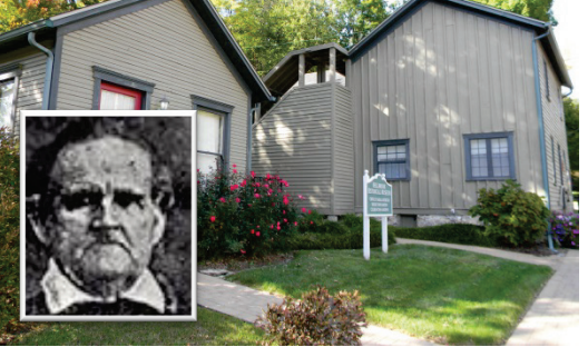
Pictured above: the Bellbrook Historical Museum and Stephen Bell

The Bellbrook Historical Museum will be holding our "Antiques & Uniques" sale on May 20. We will be located near the Garden Club's Annual Plant Sale at the school building located at 51 South East Street in downtown Bellbrook.