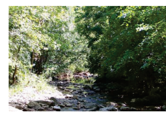
Pictured above: Possum Run in the Summer. Possum Run is a tributary for the Little Sugarcreek and the Little Miami River

Pets Please be considerate and clean up after your pets. Do not leave pet waste on other peoples' property when you are out walking your pet.