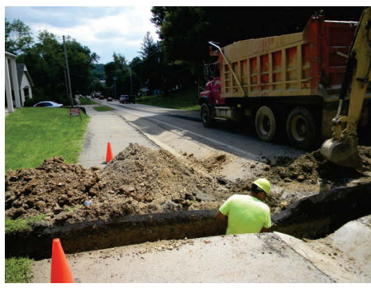
Pictured above: installation of a new fire hydrant on North Main Street.

The city engineer has designed improvements to a drainage culvert at Vemco Drive and Firebird Drive to assist with storm drainage issues in the area. Bids are currently being collected with a goal to award the project in August. The project is anticipated to be complete by November 1.