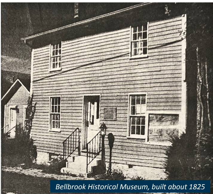
Bellbrook Historical Museum, built about 1825

From educational exhibits to community celebrations, the Bellbrook Historical Museum offers a meaningful way to connect with local history and one another. We look forward to seeing you this season.